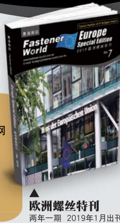
▲ 歐洲螺絲特刊 两年一期 2019年1月出刊