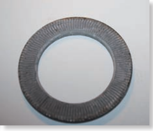
Fig. 6. Ridges on the washer

The external part of the washers has ridges which are supposed to hold the bolt head from turning. Instead, they have embedded themselves into the bolt head causing a loss of clamp load which induced metal fatigue.