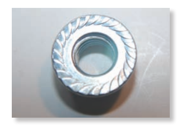
Fig. 2. Serrated washer face

As the name implies, these are cold formed serrations that may be under the head of rivets, machine screw products, small bolts or on the underside of a flanged nut. These products are not to be used with a washer as the serrations are meant to bite into the joint material to form counterrotational resistance.