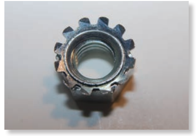
Fig. 3. Keps nut— Ideal for quick assemblies for automotive use and sheet metal assembly.

The Keps, or K Nut, is the trade marked name of ITW Shakeproof. This provides for a pre-assembled, free spinning, externally toothed washer.