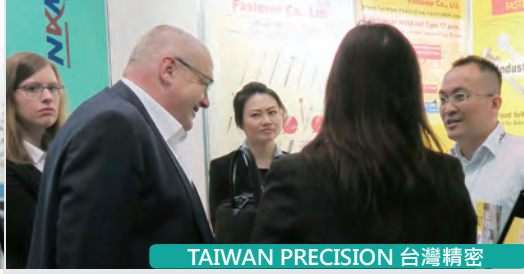
TAIWAN PRECISION 台灣精密