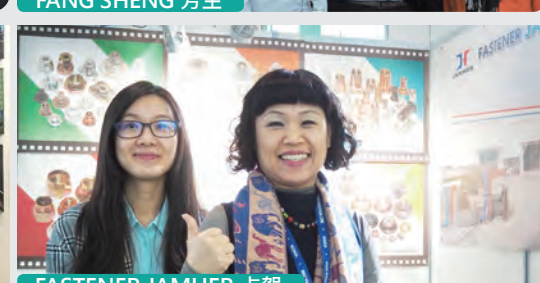
FASTENER JAMHER 占賀