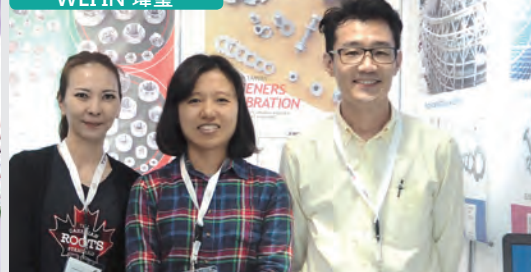
WEI IN 瑋瑩