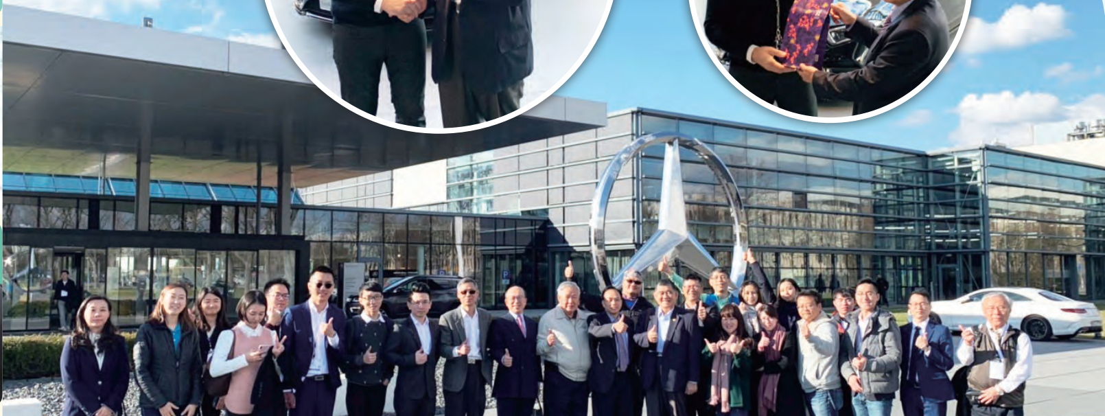
Taiwanese exhibitors visited the manufacturing plant of M. Benz.