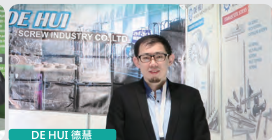
DE HUI 德慧