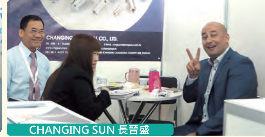
CHANGING SUN 長晉盛