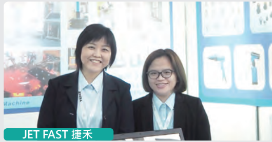
JET FAST 捷禾