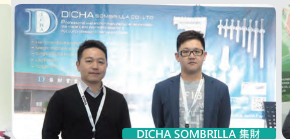
DICHIA SOMBRILLA 集財