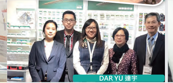
DAR YU 達宇