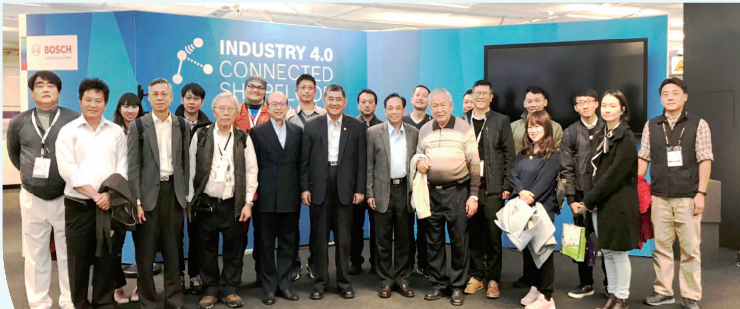
Taiwanese exhibitors visited the plant of Bosch utilizing Industry 4.0 technology