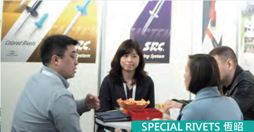
SPECIAL RIVETS 恆昭