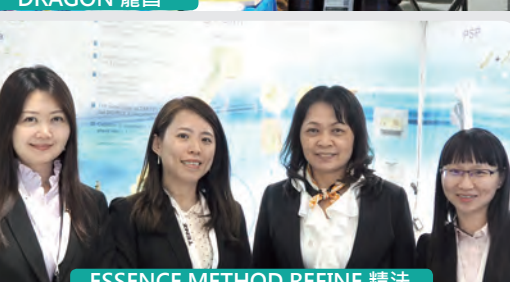
ESSENCE METHOD REFINE 精法