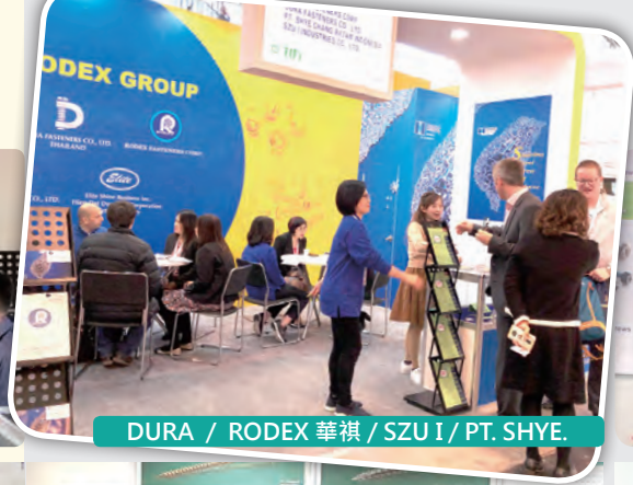
DURA / RODEX 華祺 / SZU I / PT. SHYE.