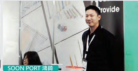
SOON PORT 鴻錡