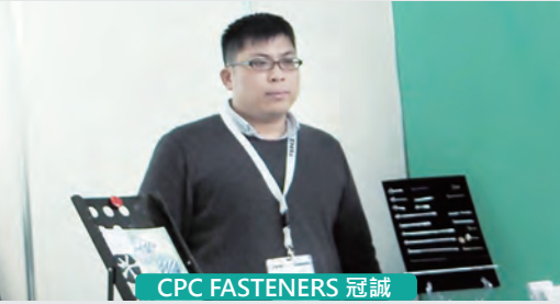
CPC FASTENERS 冠誠