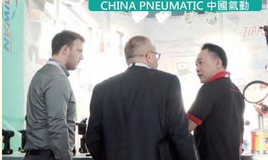
CHINA PNEUMATIC 中國氣動