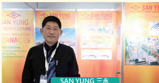
SAN YUNG 三永