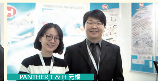
PANTHER T & H 元揚