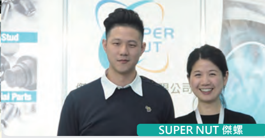
SUPER NUT 傑螺