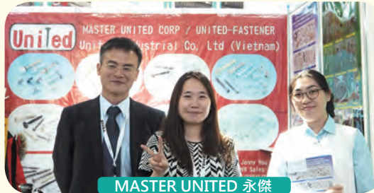
MASTER UNITED 永傑