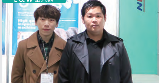
L & W 金大鼎