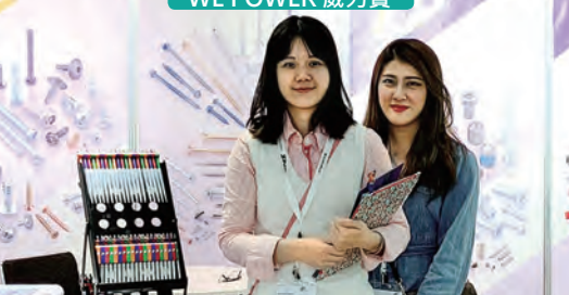
WE POWER 威力寶