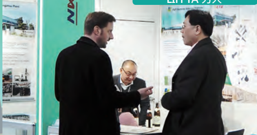
LIH TA 力大