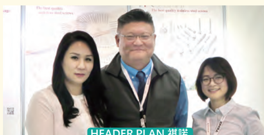
HEADER PLAN 祺諾