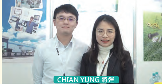
CHIAN YUNG 將運