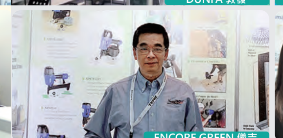
ENCORE GREEN 儀吉