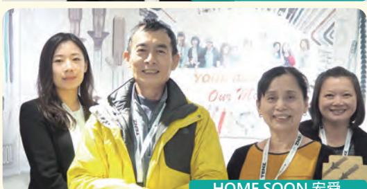
HOME SOON 宏舜