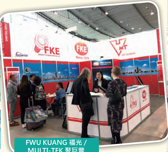
FWU KUANG 福光 / MULTI-TEK 聚巨豐