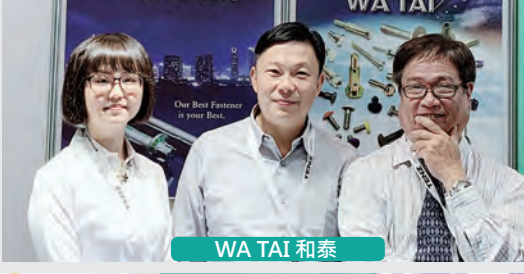
WA TAI 和泰