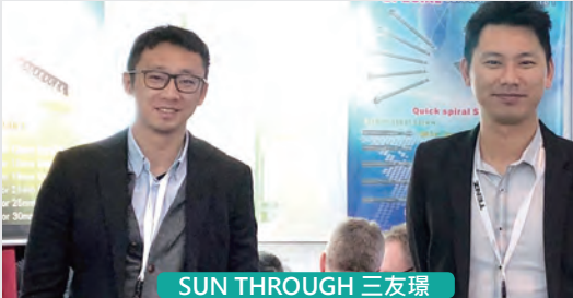
SUN THROUGH 三友環