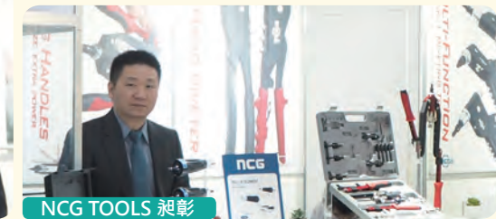
NCG TOOLS 昶彰