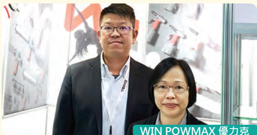
WIN POWMAX 優力克