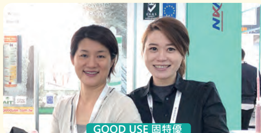
GOOD USE 固特優