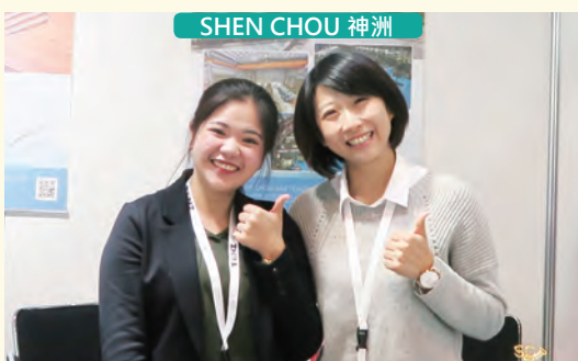
SHEN CHOU 神洲