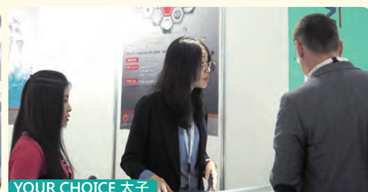
YOUR CHOICE 太子