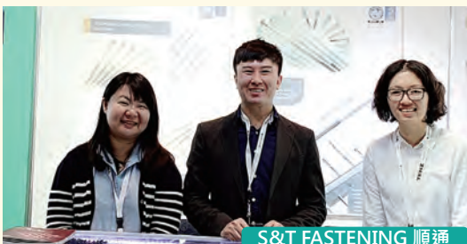
S&T FASTENING 順通