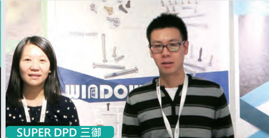
SUPER DPD 三御