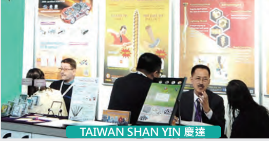
TAIWAN SHAN YIN 慶達