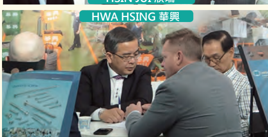
HWA HSING 華興