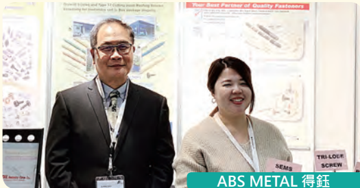
ABS METAL 得鈺