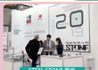
STEEL STONE 岡岩