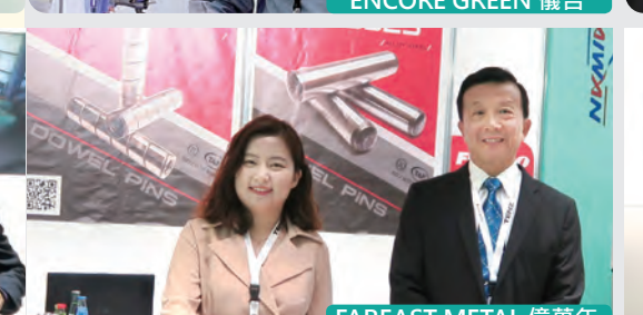
FAREAST METAL 億萬年