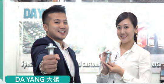
DA YANG 大揚