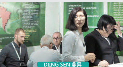
DIING SEN 鼎昇