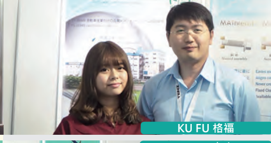
KU FU 格福