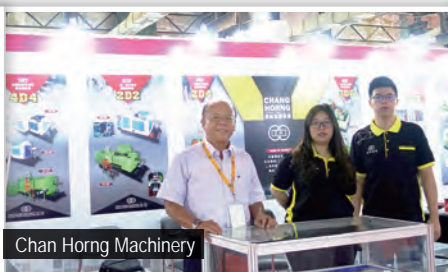
Chan Horng Machinery