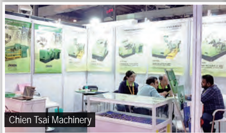
Chien Tsai Machinery