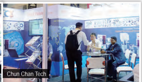
Chun Chan Tech