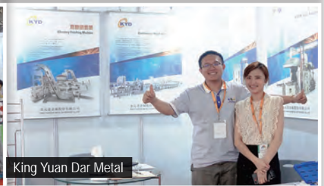
King Yuan Dar Metal