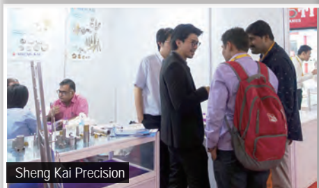
Sheng Kai Precision