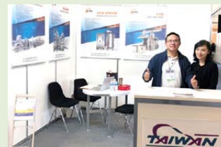
King Yuan Dar