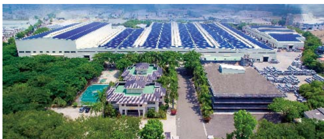
▲ Tong Hwei Enterprise