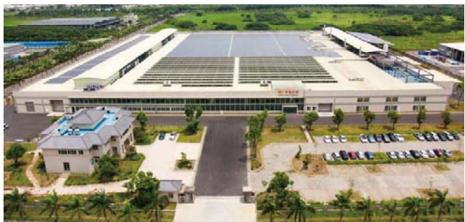
▲ Ming Hwei Energy