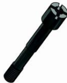
PROJECTED SCALE 4:1

Country: India Company: SG Looking for: Mild steel screws, (any grade of mild steel acceptable); quantity: 1 million pieces/month; price USD 14.00/1000 pieces, CIF Indian port Posted on: Oct/19/2019