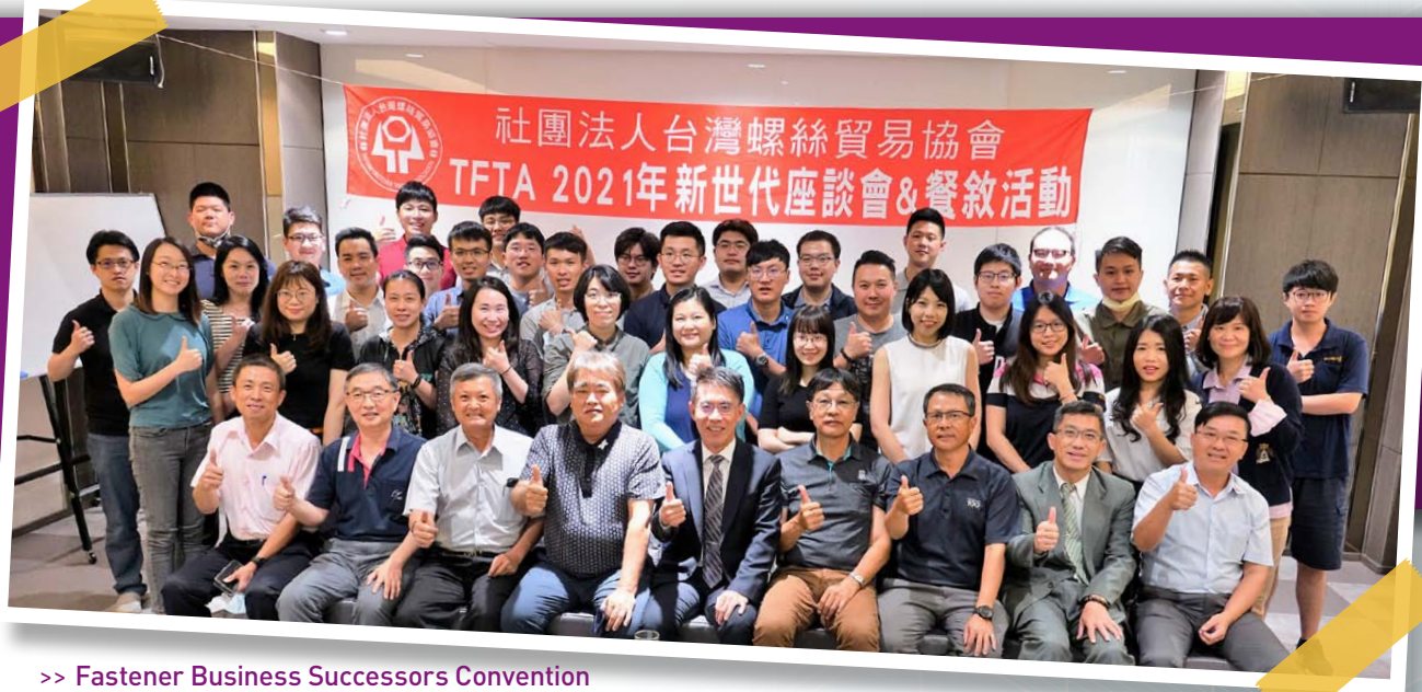
>> Fastener Business Successors Convention

Throwing back to the important activities by TFTA in 2021, in April they held a talk session with fastener business successors as well as a gathering of Northern Chapter members, in October was a factory tour at Ching Chan Optical Technology, and in November was the annual member representatives assembly. Apart from gatherings, the association opened training courses at MIRDC in the third and fourth quarter of 2021. The association worked with MIRDC on a fastener forming/heading course and a fastener threading