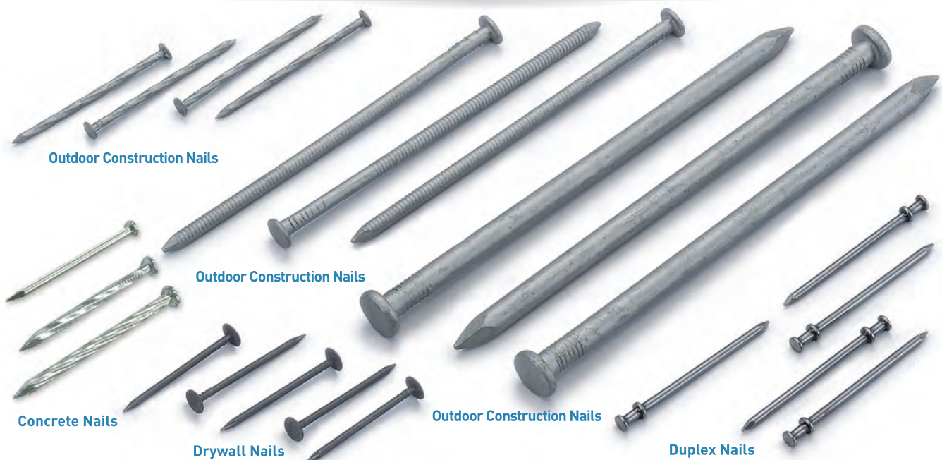
Outdoor Construction Nails