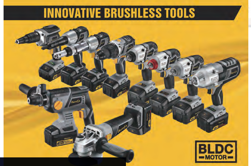
專利研發德克斯 系列工具享譽全球 車王電子股份有限公司

Patented Durofix Tools Gain Worldwide Reputation Mobiletron Electronics Co., Ltd.