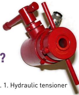
Fig. 1. Hydraulic tensioner