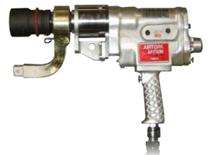
Fig. 3. Powered torque wrench