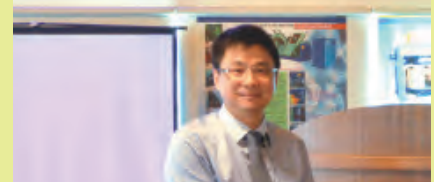
President Chi-Hung Chen (Gwo Lian) 国联董事长 陈志宏先生

President Chi-Hung Chen says the Jiaxing plant spans around 13,000m 2 . 80% of the machines produced in the plant use components imported from Taiwan. 80% of the machines are sold in China and 20% are sold to overseas market. The headquarters in Taiwan introduces techniques and components from Europe, US, and Japan. So far Gwo Lian's products have been sold to 36 countries. The company has developed multiple patented products. Its wire drawing equipment can cope with 1,500 wires per minute. This is the highest speed within the industry.