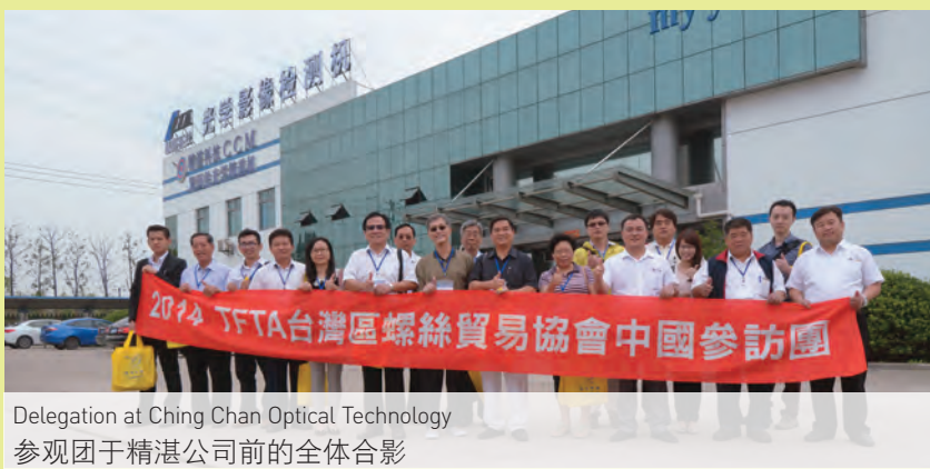
Delegation at Ching Chan Optical Technology 参观团于精湛公司前的全体合影

Ching Chan Optical Technology Co., Ltd. (former Ching Chan Machinery Co.,Ltd.) was established in 1992 and is headquartered in Kaohsiung, Taiwan. In the beginning the company focused on the development of various vibratory feeders and related machines for screws and nuts. With the persistence on technological innovation and quality upgrade, the team of the