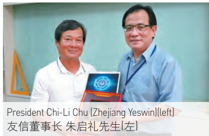
President Chi-Li Chu (Zhejiang Yeswin)(left) 友信董事長 朱启礼先生(左)

station cold forging machines, pneumatic 4 spindles tapping machines, and non-standard cold forged parts, most of which are sold domestically. Its annual revenue is nearly RMB0.3 billion.