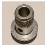
Figure 9: Example of Axial and Cross Drilled Holes