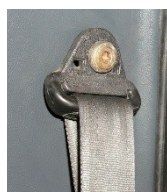
Figure 1: Example of Seat Belt Anchorage Screw

To accomplish this, what might otherwise be a pretty commonplace screw is transformed into a highly engineered specialty fastener. Normally a thread forming screw of this type would receive case hardening treatment. However, to provide the strength in the point area and the toughness in the body area, these fasteners are made of alloy steel, through hardened to HRC33-39 and completed by induction hardening on the point. This unique design combination allows the screw to perform its thread forming function as well as provide safe and effective anchorage for the seat belt. The anchorage function is exceptionally important because in an accident, those buckled-in depend on the seat belt harness attachment point to not break under the influence of a strong impact load, which it would be prone to do if the screw were simply a traditional case hardened, thread forming screw.