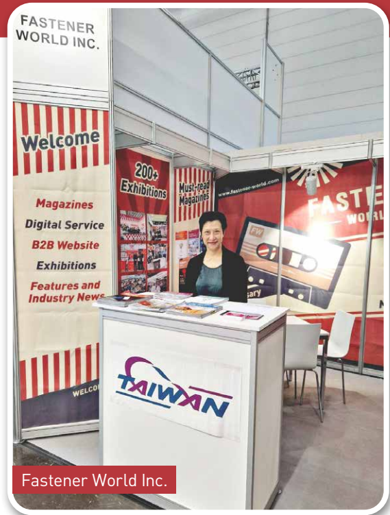
Fastener World Inc.

Fastener World Inc. also signed up to participate in the exhibition in 2024. Through the distribution of our magazines on-site, we interacted with buyers from Germany, neighboring European countries, and even from the Americas and Asia, and introduced to visitors a reliable and efficient sourcing platform that could enable them to search for more high-quality suppliers in a one-stop way, actively playing the role of a bridge between buyers and sellers. During the 5 days, our stand attracted buyers interested in cooperating with Taiwanese and global quality suppliers to make their inquiries.