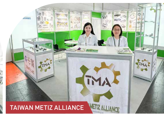
TAIWAN METZ ALLIANCE