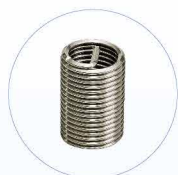
钢丝螺套 Free Running

ONE-STOP SERVICE FOR SCREW SLEEVE PRODUCTS AND TECHNOLOGY