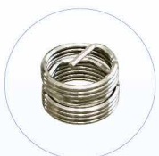
自锁螺套 Screw Lock