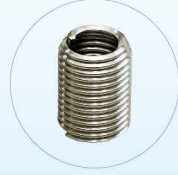
盲孔螺套 Blind Hole Screw Sleeve