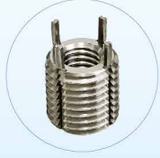
插销螺套 Pin Socket

Wuxi Wuda Machinery Technology Co., Ltd. focuses on advanced thread technology and product research and development, enhancing its thread inspection capabilities to international standards. Through the development of elastic thread fasteners, internal thread improvement technology, and independent innovation in fastening structure design, it has improved the tensile and yield strength, precision, resistance to high and low temperatures, and high corrosion resistance of elastic internal threads. The anti-loosening performance, quick installation and other features have been innovated in application and precisely designed in structure. The product has broken through the single product of steel wire thread inserts, including special-shaped wire materials, matching tools, thread insert assembly equipment, thread insert testing and measuring tools, thread insert production equipment and tooling, etc., gradually improving technology and quality. Take providing advanced fastening technology products for outstanding Chinese enterprises as the corporate value and mission!