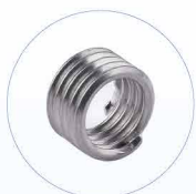
无尾螺套 Tailless Screw Sleeve