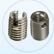
自攻螺套 Self-Tapping Screw Sleeves