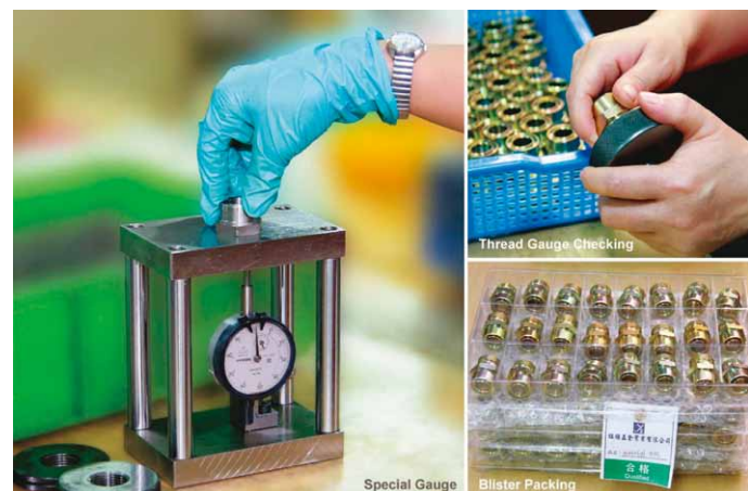
Capability to design special measuring device