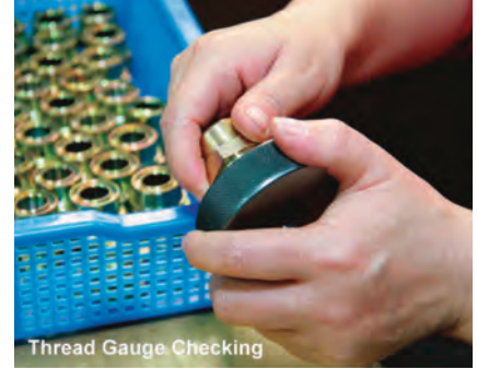
Thread Gauge Checking

Yuh Chyang is reputable for micro precision fasteners and components for spheres of automobiles/motorcycles. It supplies safety parts for core engines and braking systems to BMW, VOLVO, Benz, and Scania. Yuh Chyang’s production ranges from \Phi 1mm to \Phi 100mm in diameter, and up to 1,000mm in length. It processes materials including stainless steel, steel, aluminum, and copper. Its revenue is deeply rooted in the European market (60%), North American market (25%), Asia (10%), and the Middle East (3%).