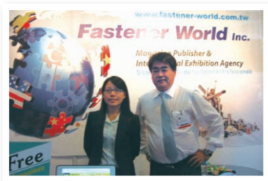
Fastener World Inc. 匯達