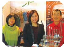
Home Soon 宏舜