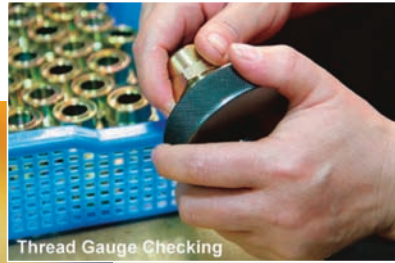
Thread Gauge Checking