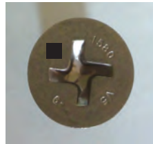
Figure 1: NAS 1580-V5-9

In these examples, the information gleaned by the head markings is basically the diameter, length, and material. The part itself serves to define some of the other information such as recess style and plating type. In addition to the actual marking, each head will