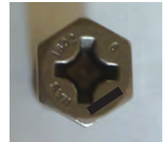
Figure 3: NAS 1802-6

be marked with a manufacturer's identification. These are represented by the black boxes in these pictures.