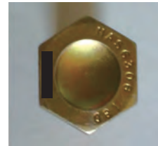
Figure 2: NAS6306-18D