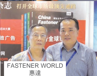
FASTENER WORLD 惠達