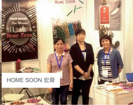
HOME SOON 宏舜