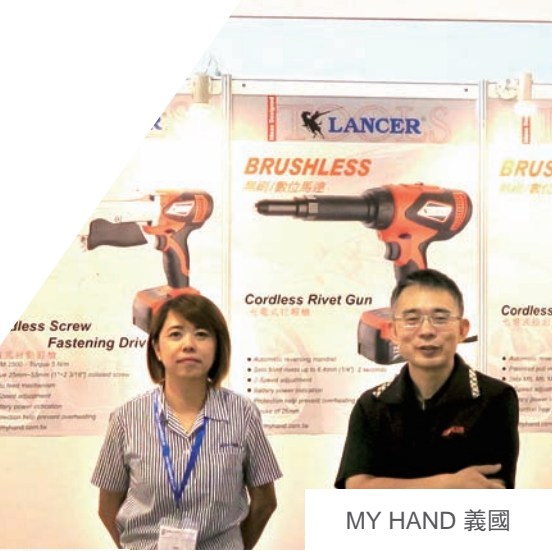
MY HAND 義國