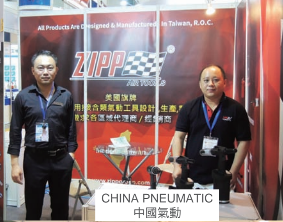
CHINA PNEUMATIC 中國氣動