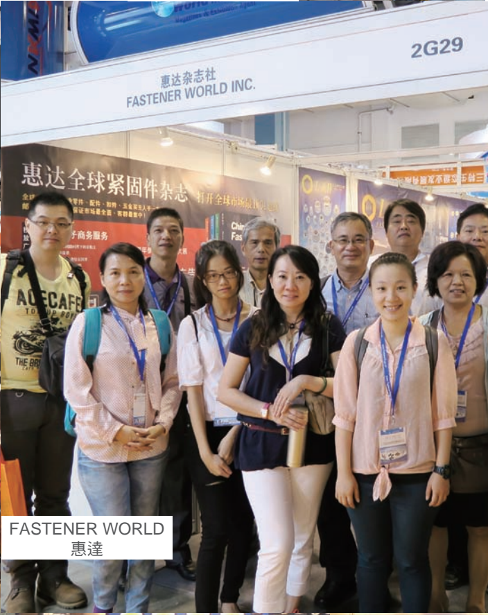
FASTENER WORLD 惠達