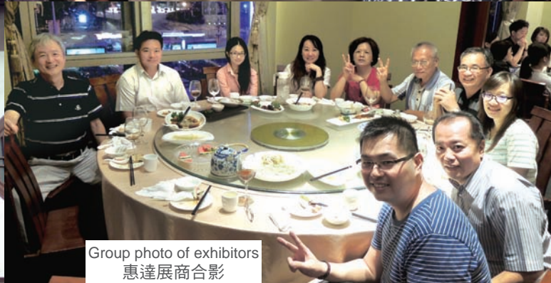
Group photo of exhibitors 惠達展商合影