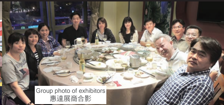
Group photo of exhibitors 惠達展商合影