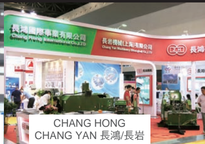
CHANG HONG CHANG YAN 長鴻/長岩