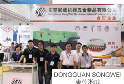
DONGGUAN SONGWEI 東莞崧威