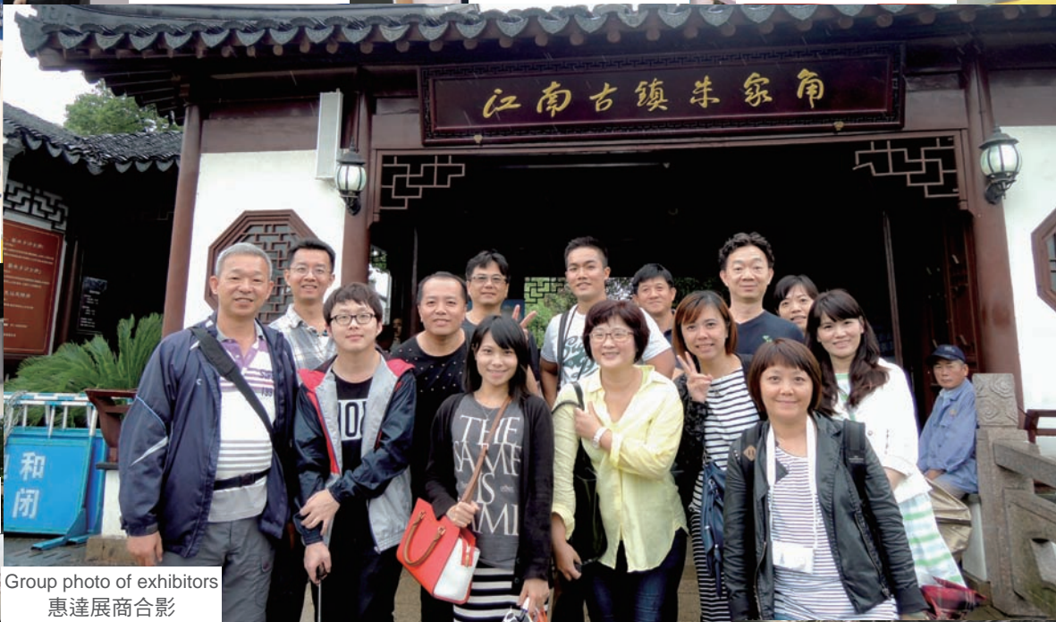
Group photo of exhibitors 惠達展商合影