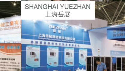
SHANGHAI YUEZHAN 上海岳展