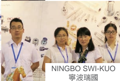
NINGBO SWI-KUO 寧波瑞國