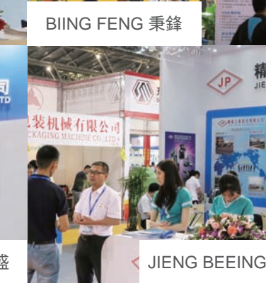
JIENG BEEING 精斌