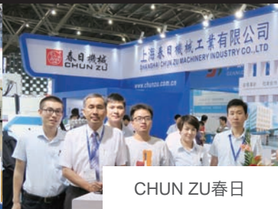
CHUN ZU 春日