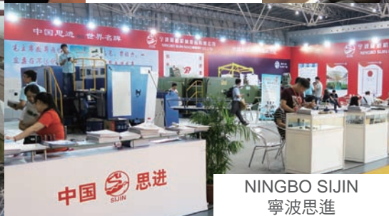
NINGBO SIJIN 寧波思進

隨著行業的快速發展，不少企業開始重視自身品牌建設，以特殊裝潢來強化企業形象。今年上海展，100平方米以上的特裝企業占到展商總數的3%，展位裝修精美，特色十足。對於業內人士而言，參加上海國際緊固件專業展，不僅是視覺饗宴，更能在展會上找到航空航太、軍用、汽車、建築及新型緊固件成品與生產設備。