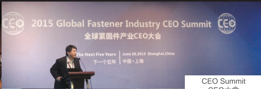
CEO Summit CEO大會