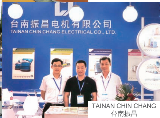
TAINAN CHIN CHANG 台南振昌