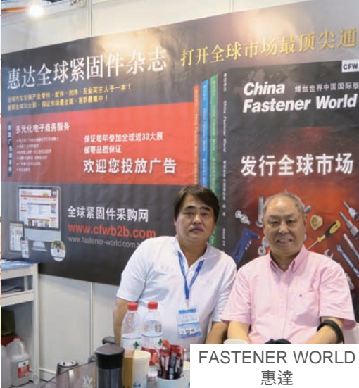
FASTENER WORLD 惠達