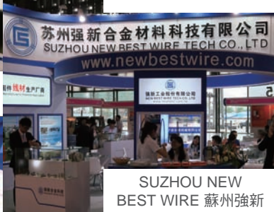
SUZHOU NEW BEST WIRE 蘇州強新