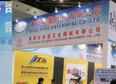
BIING FENG 秉鋒