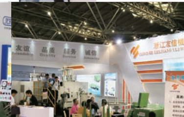
ZHEJIANG YESWIN 浙江友信