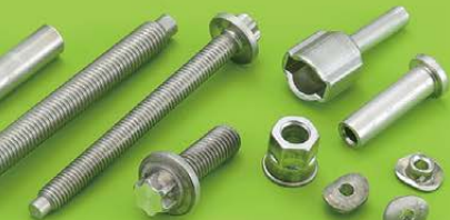
▲ Aluminum alloy