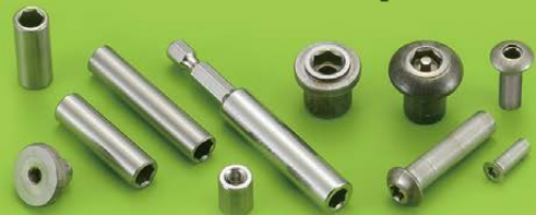
▲ Stainless Steel