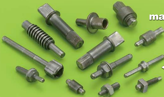
◀ Special Screws

We have 40 years of professional manufacturing experience to help customers solve fastener problems