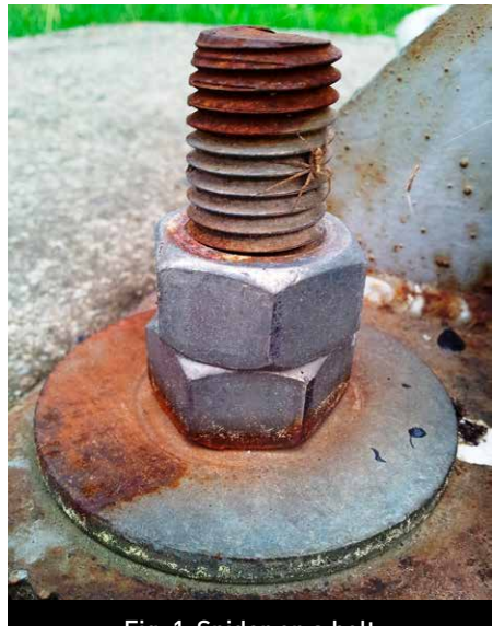
Fig. 1. Spider on a bolt

How to clean the surface of rusted bolts? For example, can a spider ( Fig. 1 ) help with that?