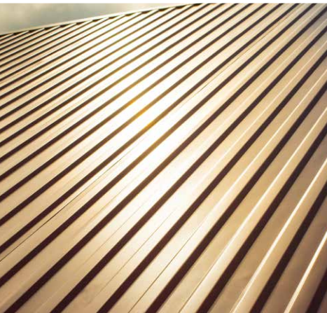
Figure 2: Example of a Standing Seam Roof

Although metal has been a material option for roofs for hundreds of years, because of challenges posed by high cost, lousy appearance, and poor longevity, it has only recently become a feasible mainstream choice. In fact, today in the United States metal roofing represents one of the fastest growing areas in the residential roofing segment. It is now possible to choose from a selection of metal roofing solutions that either provide large, continuous panels or metal alternatives to traditional roofing materials such as slate, tiles, shakes, and shingles in attractive designs and at affordable prices. Although some of these solutions are more expensive in the short-term than their traditional roofing options, their superior durability and life expectancy makes them a smarter long-term investment. Of course, like any roofing material they must be securely fixed to the roofing substructure to protect the interior spaces below. Since metal roofing solutions exhibit their own unique qualities and challenges, many of these solutions require special or different fasteners from nails and staples used with traditional roofing solutions. As metal roofing has grown then, so has the need for innovation and engineering in the fasteners for this market space.