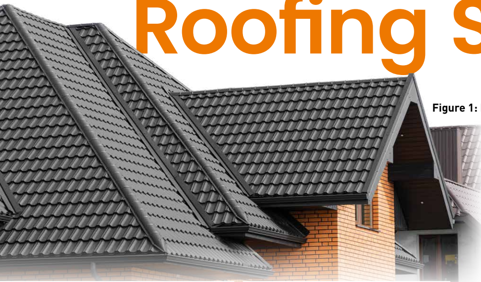
Figure 1: Metal Roof Made to Look Like a Tile Roof

Although metal has been a material option for roofs for hundreds of years, because of challenges posed by high cost, lousy appearance, and poor longevity, it has only recently become a feasible mainstream choice. In fact, today in the United States metal roofing represents one of the fastest growing areas in the residential roofing segment. It is now possible to choose from a selection of metal roofing solutions that either provide large, continuous panels or metal alternatives to traditional roofing materials such as slate, tiles, shakes, and shingles in attractive designs and at affordable prices. Although some of these solutions are more expensive in the short-term than their traditional roofing options, their superior durability and life expectancy makes them a smarter long-term investment. Of course, like any roofing material they must be securely fixed to the roofing substructure to protect the interior spaces below. Since metal roofing solutions exhibit their own unique qualities and challenges, many of these solutions require special or different fasteners from nails and staples used with traditional roofing solutions. As metal roofing has grown then, so has the need for innovation and engineering in the fasteners for this market space.