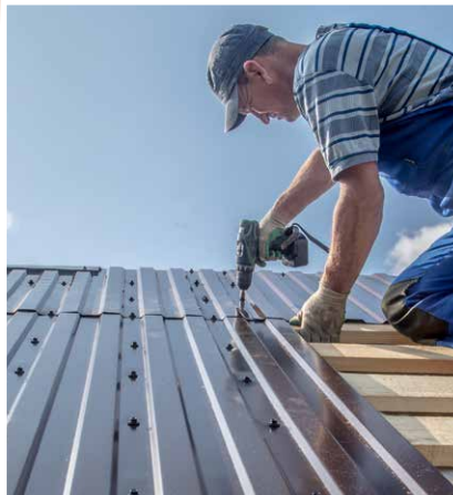
Figure 3: Installation of Exposed Fastener Metal Roof System