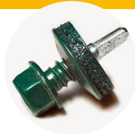
Figure 4: Example of Bonded Dealing Washer