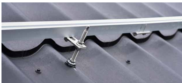
Figure 7: Example of Roof Mounting Solar Fastener System