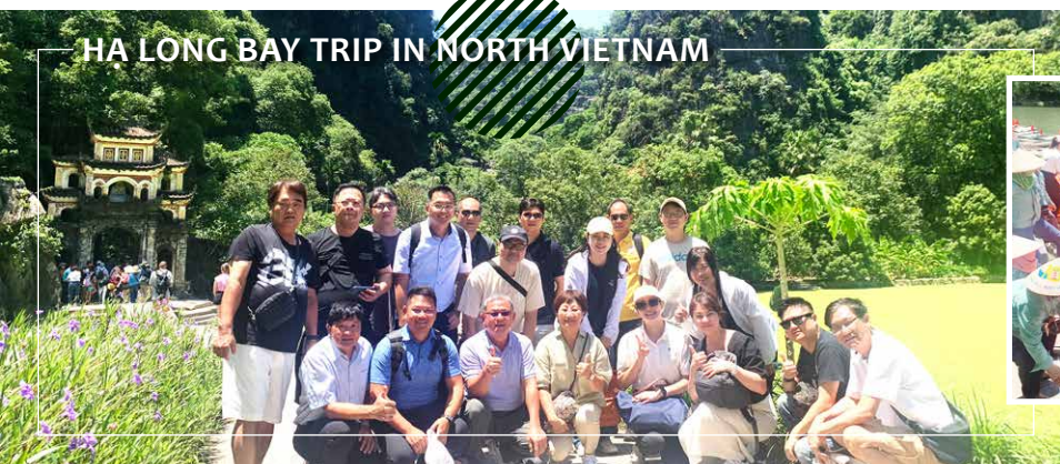
HA LONG BAY TRIP IN NORTH VIETNAM