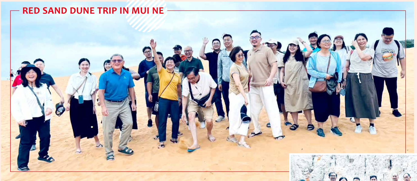
RED SAND DUNE TRIP IN MUI NE