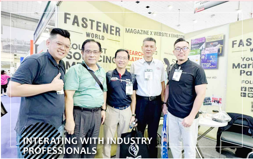
INTERACTING WITH INDUSTRY PROFESSIONALS