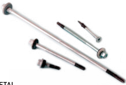
BI-METAL DRILLING SCREWS

Its Vietnam and China plants specialize in carbon steel screws—the Vietnam plant focuses on small screws and self-drilling screws, and the China plant on large bolts. The Indonesia and Malaysia plants primarily produce stainless steel screws. All of the plants’ manufacturing processes—including heading, threading, shank slotting, tail clamping, heat treatment, and plating—go through rigorous in-house quality control and are completed one-stop.