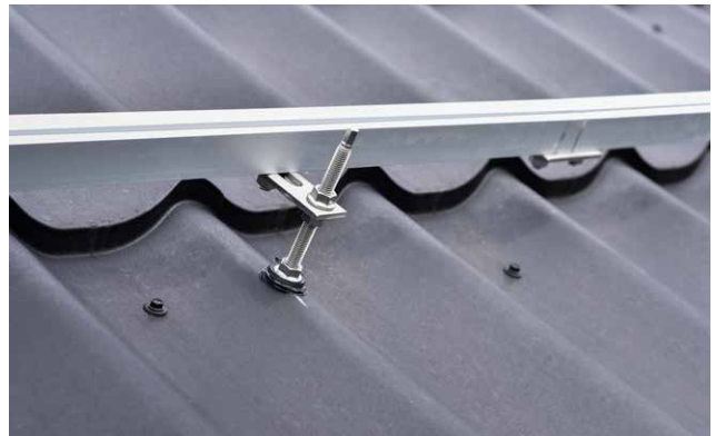
Figure 7: Example of Roof Mounting Solar Fastener System

Copyright owned by Fastener World / Article by Laurence Claus