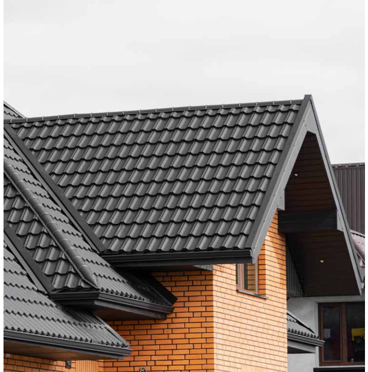
Figure 1: Metal Roof Made to Look Like a Tile Roof

Although metal has been a material option for roofs for hundreds of years, because of challenges posed by high cost, lousy appearance, and poor longevity, it has only recently become a feasible mainstream choice. In fact, today in the United States metal roofing represents one of the fastest growing areas in the residential roofing segment. It is now possible to choose from a selection of metal roofing solutions that either provide large, continuous panels or metal alternatives to traditional roofing materials such as slate, tiles, shakes, and shingles in attractive designs and at affordable prices. Although some of these solutions are more expensive in the short-term than their traditional roofing options, their superior durability and life expectancy makes them a smarter long-term investment. Of course, like any roofing material they must be securely fixed to the roofing substructure to protect the interior spaces below. Since metal roofing solutions exhibit their own unique qualities and challenges, many of these solutions require special or different fasteners from nails and staples used with traditional roofing solutions. As metal roofing has grown then, so has the need for innovation and engineering in the fasteners for this market space.