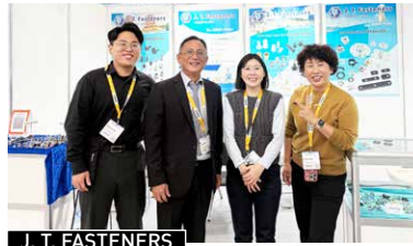
J. T. FASTENERS