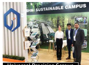
Universal Precision Screws